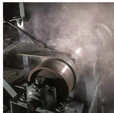
4 Friction heat between rolling components can be extreme enough to light both the material and belt