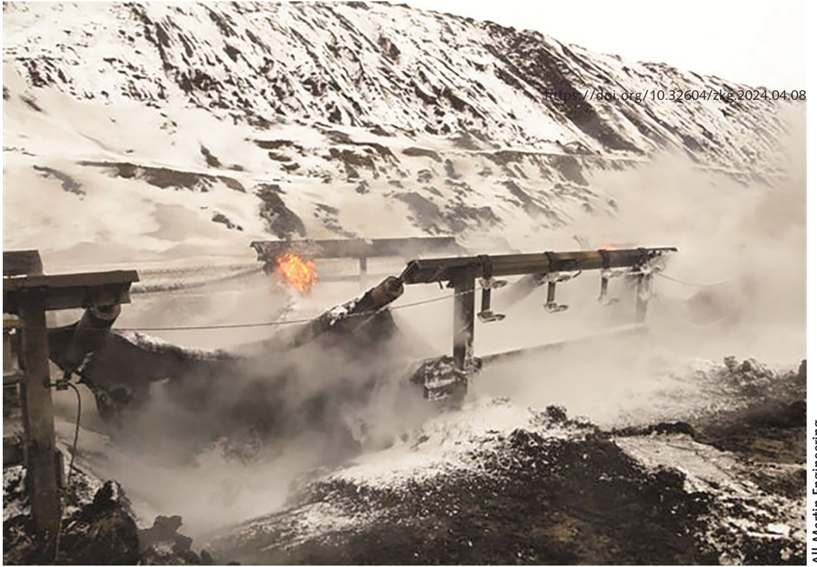
All Martin Engineering

Conveyor fires can happen anywhere, at any time, even outdoors in the cold