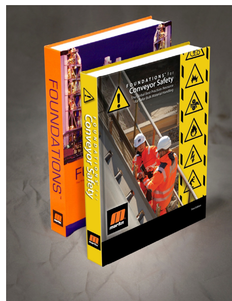
3 Foundations for Conveyor Safety is a 500+ page reference volume dedicated to worker safety