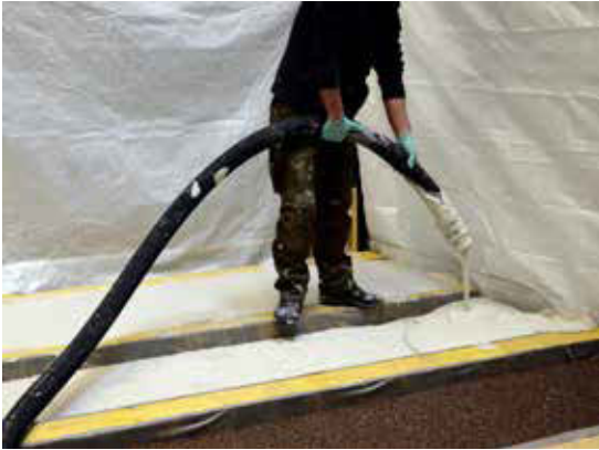
Materials Research and Testing Institute Weimar (MFPFA)