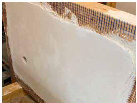
8 Foam gypsum compartment plastered with gypsum plaster (demonstrator project Leichtgips)

Another formulation is suitable for material-compatible injection of gypsum-containing masonry. It is stable when wet and has low