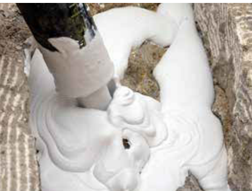
Materials Research and Testing Institute Weimar (MFPFA)

Commercially available CAF consumes less resources and could save approx. 70% CO 2 at the component level. The primary energy necessity is at most half as high. One of the commercially available flow screed compounds requires only about 62% grey energy compared to Portland cement (PZ) with emissions of 29% of the amount of CO 2 eq/t [4, 23, 40, 51].