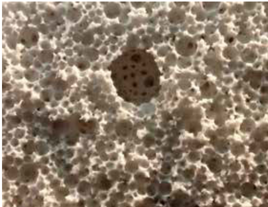
6 Fracture surface of hardened foam gypsum sample with visible pore size distribution. (Image length approx. 9 cm)

Unlike conventional cement screeds, calcium sulphate flow screeds are jointless and can be installed with little effort. The ecological balance is significantly more favourable in terms of CO 2 emissions, energy consumption and the use of FGD gypsum. A further improvement in the economic and ecological advantages can be achieved by using plaster of paris (beta hemihydrate binder) instead of the anhydrite or alpha hemihydrate binders used previously. Compared to thermally produced anhydrite binders, the production temperatures are lower and, in comparison to alpha hemihydrate, dry heating is sufficient for binder production and further grinding is not necessary. In contrast to anhydrite-based compounds, plaster of paris achieves hydration levels of 1. In addition, hydration is complete within one day. Furthermore, a screed made of hemihydrate does not form a surface-hard sintered layer, which slows down drying to the point where it is ready for covering and requires time-consuming abrasion of the anhydrite screeds. Last but not least, plaster of paris can be walked on and covered more quickly.