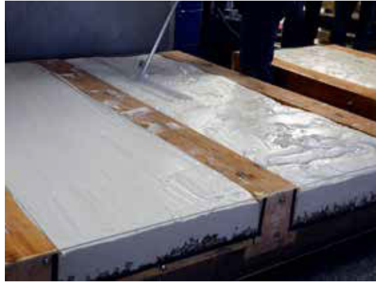
Materials Research and Testing Institute Weimar (MFPFA)