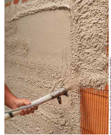
11 Practical test in the EcoStuc project, machine-processable lightweight plaster made from 100% RC gypsum [41, 44]

Materials Research and Testing Institute Weimar (MFPA)