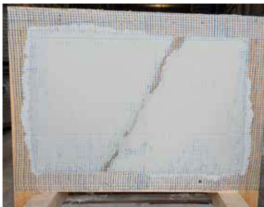
7 Formwork-free compartment filled with foam gypsum (demonstrator timber framework) with plaster base (practical test Project Leichtgips [42])

to such an extent that the strength requirements are now met. Despite a noticeably different compound composition compared to commercially available products, a self levelling flow screed can now also be produced with plaster in accordance with the standard.