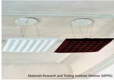
9 GIPSTEX lightweight elements, ceiling suspension variant (showcase object M1 Kunstzone Gera)

Materials Research and Testing Institute Weimar (MFPA)