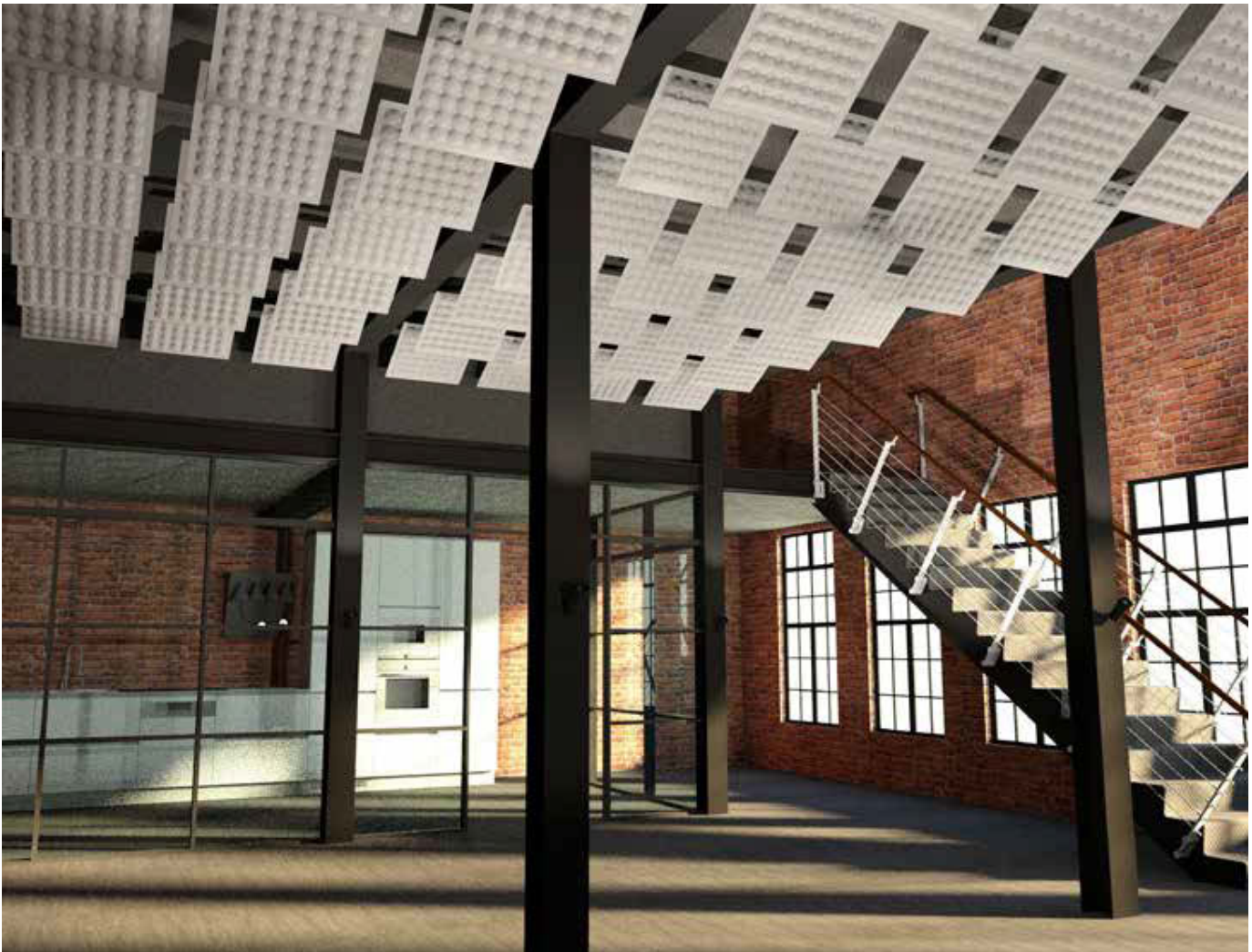
10 Software-generated visualisation of a possible arrangement of GIPSTEX lightweight elements on the ceiling when converting industrial buildings [19]

Materials Research and Testing Institute Weimar (MFPA)